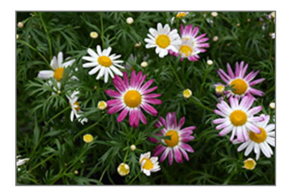
Comet Pink Shades Daisy flowers

Comet Pink Shades Daisy will grow to be about 15 inches tall at maturity, with a spread of 12 inches. This fast-growing annual will normally live for one full growing season, needing replacement the following year.