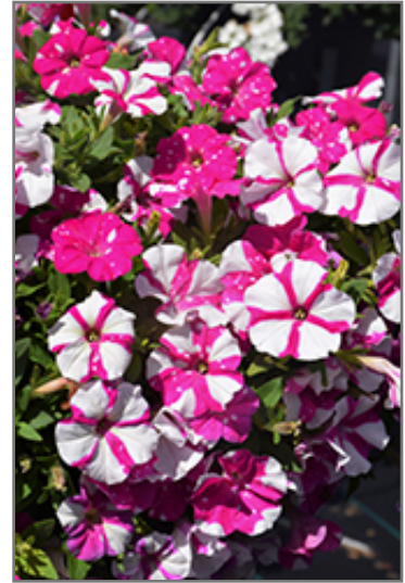
Headliner Pink Sky Petunia flowers

Headliner Pink Sky Petunia is recommended for the following landscape applications;