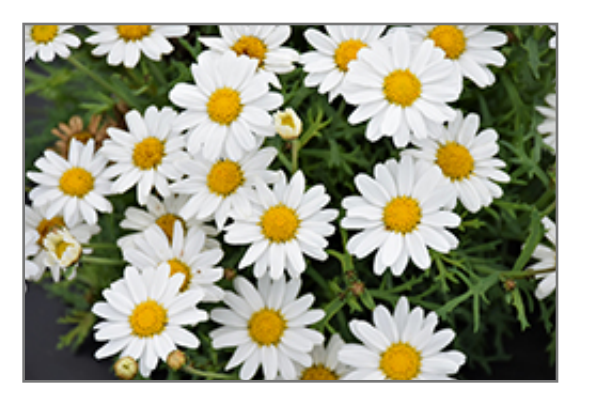
Sassy White flowers