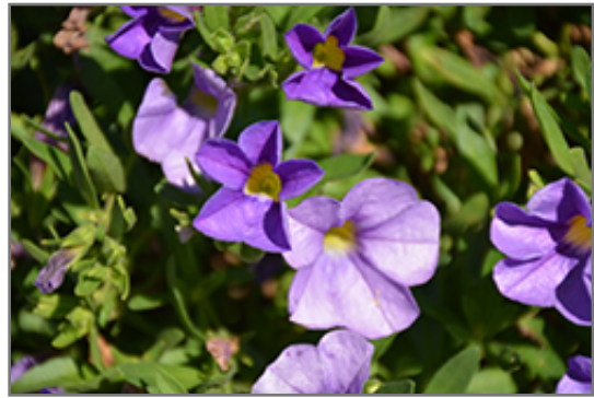
MiniFamous Neo Light Blue Calibrachoa flowers

MiniFamous Neo Light Blue Calibrachoa is recommended for the following landscape applications;