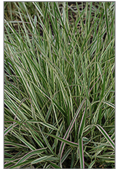
Variegated Reed Grass foliage