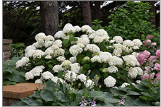
Annabelle Hydrangea in bloom