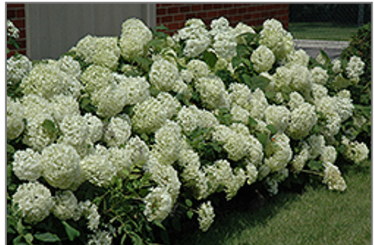
Annabelle Hydrangea in bloom