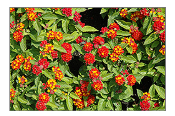
Little Lucky Red Lantana flowers