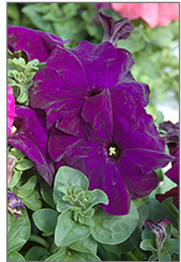
Dreams Midnight Petunia flowers