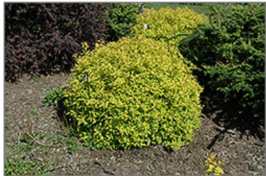
Lemon Princess Spirea