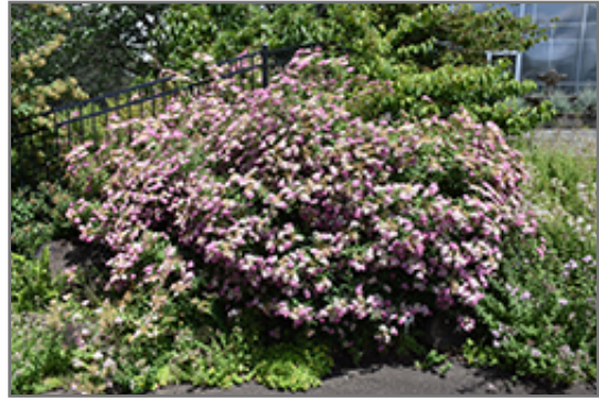
Lemon Princess Spirea in bloom

Lemon Princess Spirea will grow to be about 24 inches tall at maturity, with a spread of 3 feet. It tends to fill out right to the ground and therefore doesn't necessarily require facer plants in front. It grows at a fast rate, and under ideal conditions can be expected to live for approximately 20 years.