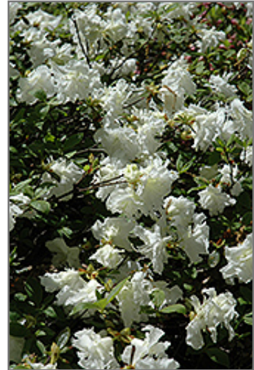
Helen Curtis Azalea flowers

Helen Curtis Azalea will grow to be about 3 feet tall at maturity, with a spread of 3 feet. It has a low canopy. It grows at a slow rate, and under ideal conditions can be expected to live for 40 years or more.