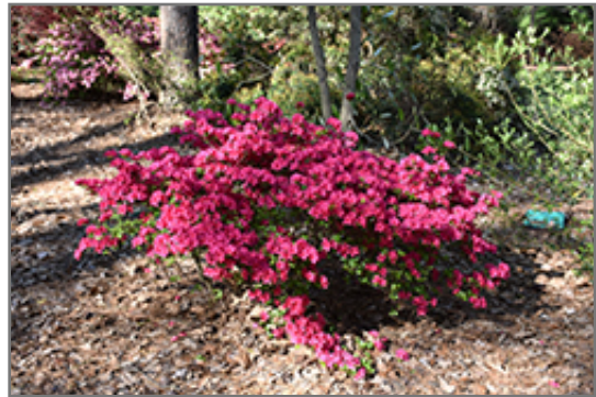
Girard's Fuchsia Evergreen Azalea in bloom