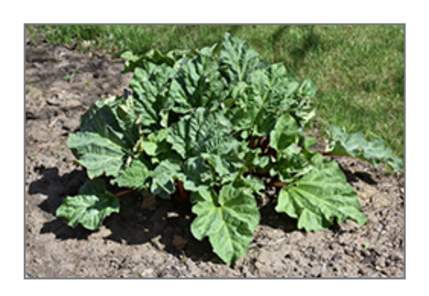
Chipman Red Rhubarb

Chipman Red Rhubarb features bold spikes of white flowers rising above the foliage from early to mid summer. Its enormous crinkled round leaves remain green in color throughout the season. The red stems are very colorful and add to the overall interest of the plant.