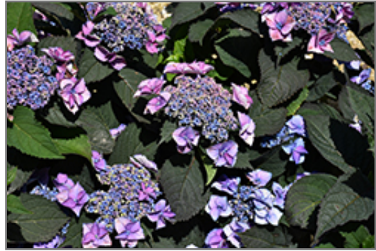
Tuff Stuff Top Fun Hydrangea flowers

Tuff Stuff Top Fun Hydrangea makes a fine choice for the outdoor landscape, but it is also well-suited for use in outdoor pots and containers. Because of its height, it is often used as a 'thriller' in the 'spiller-thriller-filler' container combination; plant it near the center of the pot, surrounded by smaller plants and those that spill over the edges. It is even sizeable enough that it can be grown alone in a suitable container. Note that when grown in a container, it may not perform exactly as indicated on the tag - this is to be expected. Also note that when growing plants in outdoor containers and baskets, they may require more frequent waterings than they would in the yard or garden.