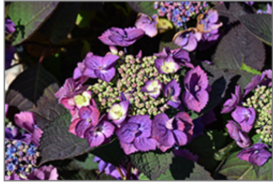
Tuff Stuff Top Fun Hydrangea flowers

Tuff Stuff Top Fun Hydrangea is recommended for the following landscape applications;