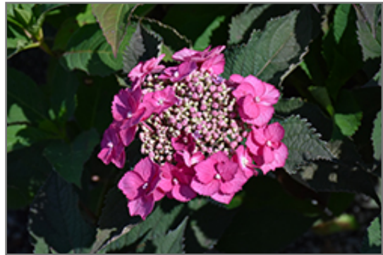
Tuff Stuff Top Fun Hydrangea flowers