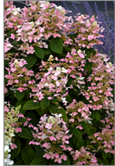
Quick Fire Hydrangea flowers