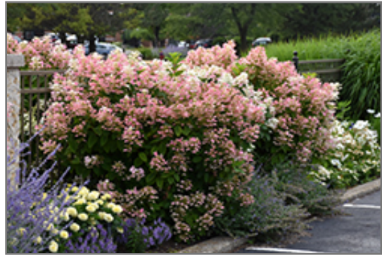
Quick Fire Hydrangea in bloom