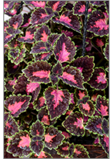
TrailBlazer Road Trip Coleus foliage

TrailBlazer Road Trip Coleus is recommended for the following landscape applications;