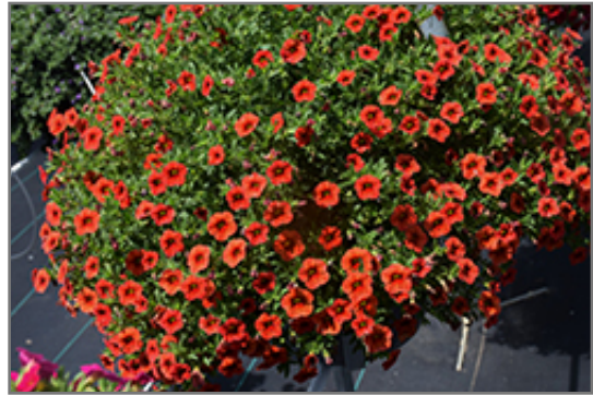
Cha-Cha Orange Calibrachoa in bloom