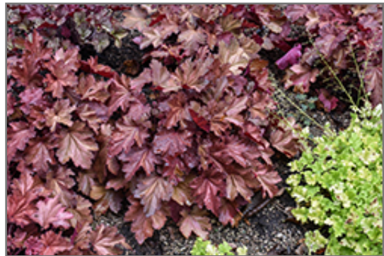
Magma Coral Bells