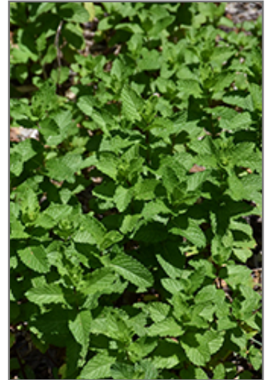
Apple Mint foliage