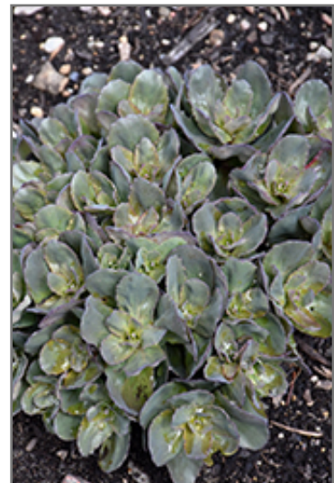
Rock 'N Grow Back in Black Stonecrop foliage