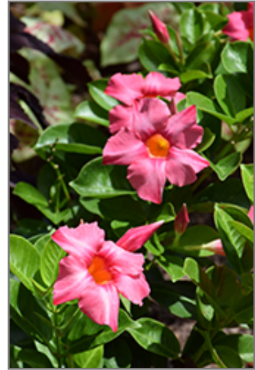
Madinia Coral Pink Mandevilla flowers

This plant does best in full sun to partial shade. It requires an evenly moist well-drained soil for optimal growth. It is not particular as to soil type or pH. It is highly tolerant of urban pollution and will even thrive in inner city environments. This particular variety is an interspecific hybrid, and parts of it are known to be toxic to humans and animals, so care should be exercised in planting it around children and pets. It can be propagated by cuttings; however, as a cultivated variety, be aware that it may be subject to certain restrictions or prohibitions on propagation.