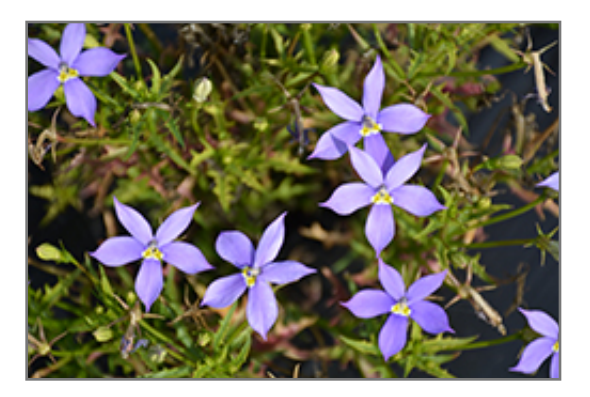
Fizz N Pop Glowing Violet Blue Stars flowers