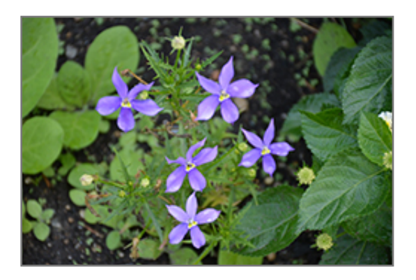
Fizz N Pop Glowing Violet Blue Stars in bloom