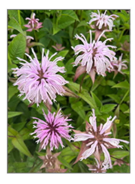
Eastern Beebalm flowers

This plant will require occasional maintenance and upkeep, and should be cut back in late fall in preparation for winter. It is a good choice for attracting bees, butterflies and hummingbirds to your yard, but is not particularly attractive to deer who tend to leave it alone in favor of tastier treats. Gardeners should be aware of the following characteristic(s) that may warrant special consideration;