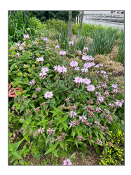
Eastern Beebalm in bloom