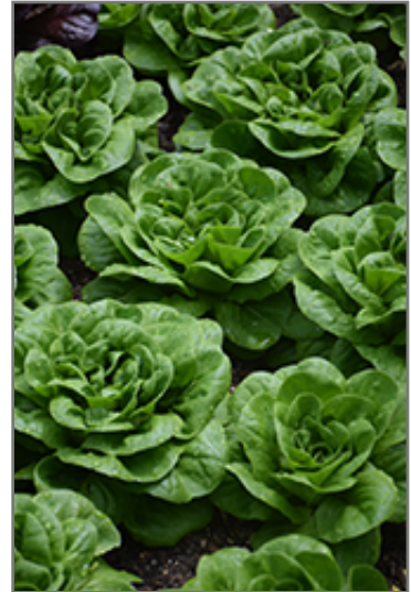
Buttercrunch Lettuce

Buttercrunch Lettuce will grow to be about 12 inches tall at maturity, with a spread of 6 inches. When planted in rows, individual plants should be spaced approximately 8 inches apart. This vegetable plant is an annual, which means that it will grow for one season in your garden and then die after producing a crop. Because of its relatively short time to maturity, it lends itself to a series of successive plantings each staggered by a week or two; this will prolong the effective harvest period.