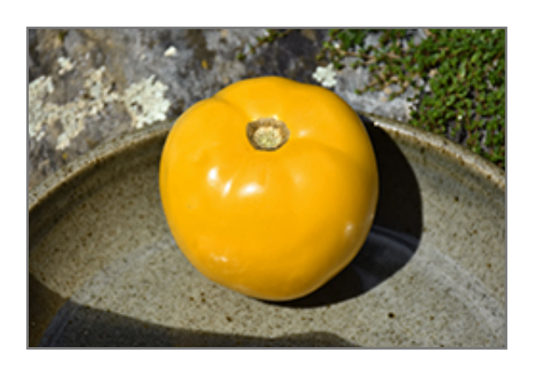
Lemon Boy Tomato fruit

Lemon Boy Tomato will grow to be about 5 feet tall at maturity, with a spread of 24 inches. When planted in rows, individual plants should be spaced approximately 3 feet apart. Because of its vigorous growth habit, it may require staking or supplemental support. This fast-growing vegetable plant is an annual, which means that it will grow for one season in your garden and then die after producing a crop.