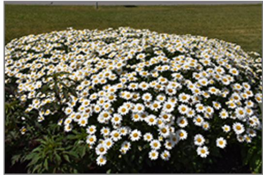
Becky Shasta Daisy in bloom