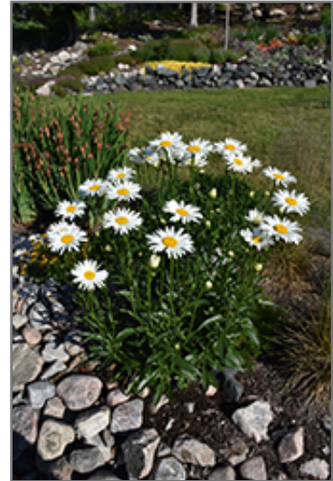
Becky Shasta Daisy in bloom

Becky Shasta Daisy is a fine choice for the garden, but it is also a good selection for planting in outdoor pots and containers. Because of its height, it is often used as a 'thriller' in the 'spiller-thriller-filler' container combination; plant it near the center of the pot, surrounded by smaller plants and those that spill over the edges. It is even sizeable enough that it can be grown alone in a suitable container. Note that when growing plants in outdoor containers and baskets, they may require more frequent waterings than they would in the yard or garden.