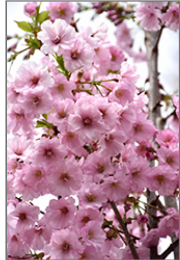
First Blush Flowering Cherry flowers