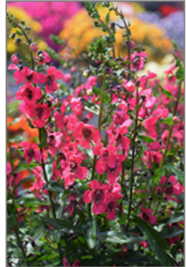
Archangel Cherry Red Angelonia flowers

Archangel Cherry Red Angelonia is a fine choice for the garden, but it is also a good selection for planting in outdoor containers and hanging baskets. It is often used as a 'filler' in the 'spiller-thriller-filler' container combination, providing a mass of flowers against which the larger thriller plants stand out. Note that when growing plants in outdoor containers and baskets, they may require more frequent waterings than they would in the yard or garden.