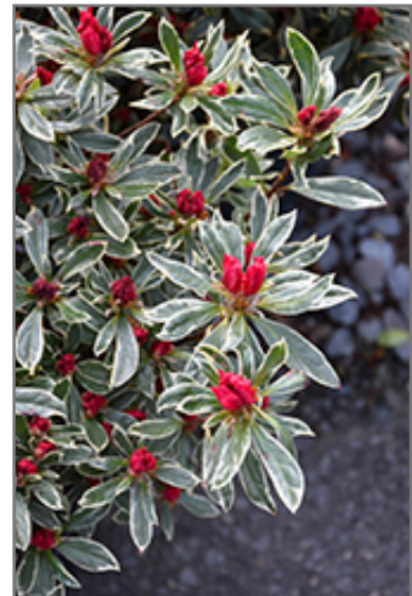
Silver Sword Azalea foliage