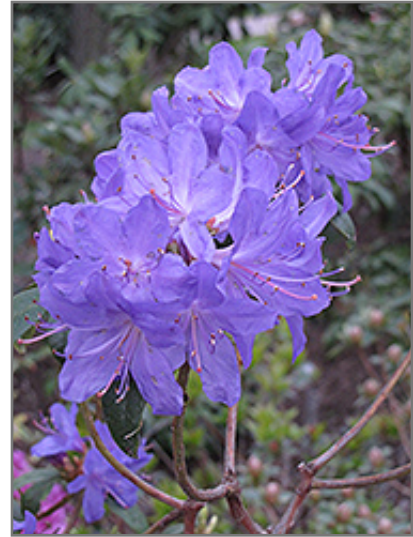
Blue Baron Rhododendron flowers