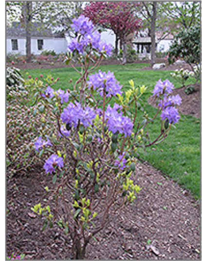
Blue Baron Rhododendron in bloom

This shrub does best in full sun to partial shade. You may want to keep it away from hot, dry locations that receive direct afternoon sun or which get reflected sunlight, such as against the south side of a white wall. It requires an evenly moist well-drained soil for optimal growth, but will die in standing water. It is very fussy about its soil conditions and must have rich, acidic soils to ensure success, and is subject to chlorosis (yellowing) of the foliage in alkaline soils. It is somewhat tolerant of urban pollution, and will benefit from being planted in a relatively sheltered location. Consider applying a thick mulch around the root zone in winter to protect it in exposed locations or colder microclimates. This particular variety is an interspecific hybrid.