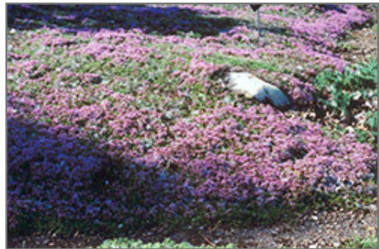
Mother-of-Thyme in bloom