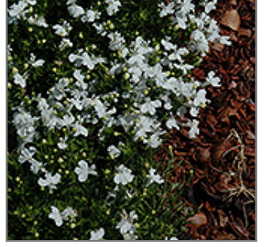
White Palace Lobelia flowers