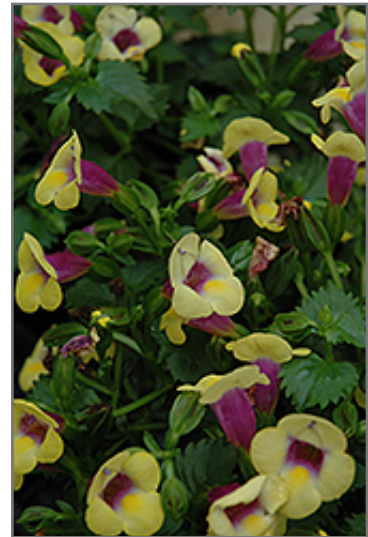
Yellow Moon Torenia flowers

Yellow Moon Torenia is recommended for the following landscape applications;