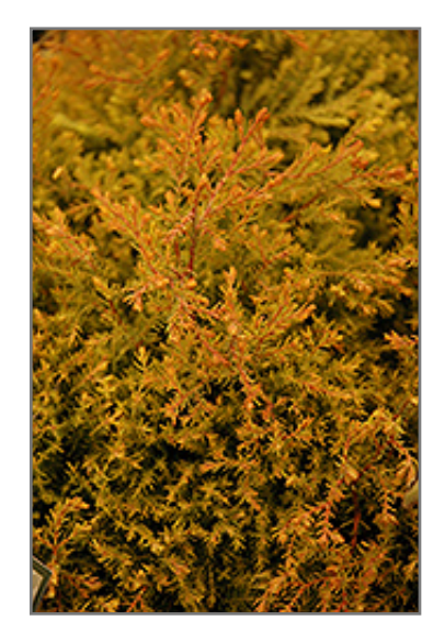
Fire Chief Arborvitae foliage