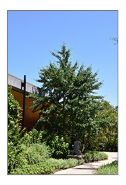
Autumn Gold Ginkgo