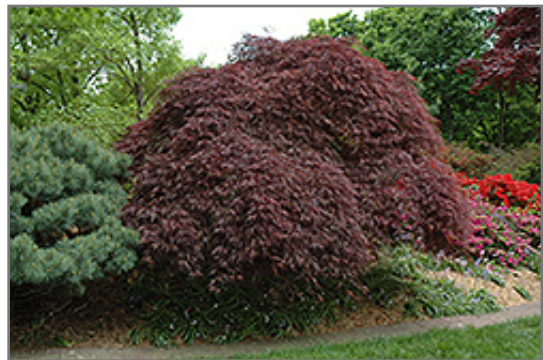
Red Select Cutleaf Japanese Maple