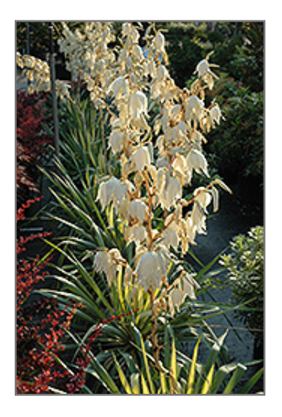
Color Guard Adam's Needle in bloom