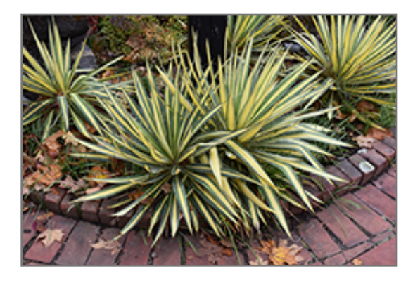
Color Guard Adam's Needle

Color Guard Adam's Needle is recommended for the following landscape applications;