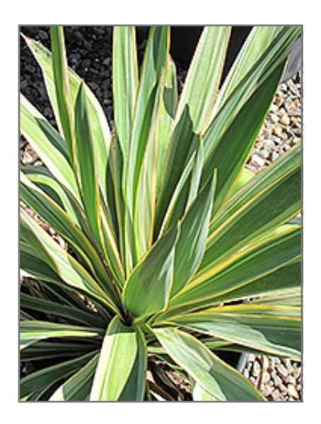
Color Guard Adam's Needle

This shrub should only be grown in full sunlight. It prefers dry to average moisture levels with very well-drained soil, and will often die in standing water. It is considered to be drought-tolerant, and thus makes an ideal choice for a low-water garden or xeriscape application. It is not particular as to soil type or pH. It is somewhat tolerant of urban pollution. This is a selection of a native North American species.