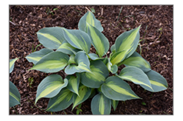
Touch Of Class Hosta