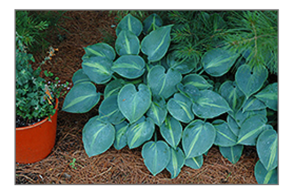
Touch Of Class Hosta

Touch Of Class Hosta is a dense herbaceous perennial with tall flower stalks held atop a low mound of foliage. Its medium texture blends into the garden, but can always be balanced by a couple of finer or coarser plants for an effective composition.