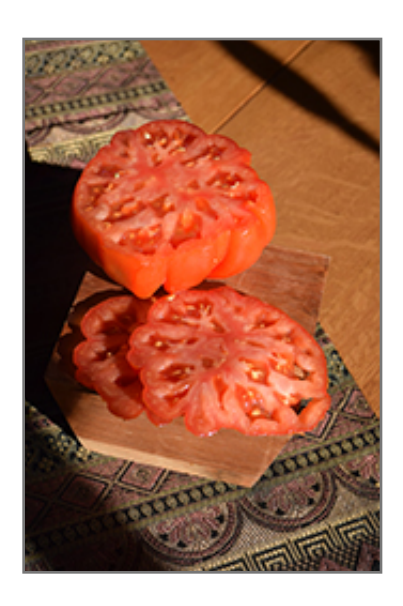
Caspian Pink Tomato fruit and flesh

Caspian Pink Tomato will grow to be about 5 feet tall at maturity, with a spread of 18 inches. When planted in rows, individual plants should be spaced approximately 24 inches apart. Because of its vigorous growth habit, it may require staking or supplemental support. This fast-growing vegetable plant is an annual, which means that it will grow for one season in your garden and then die after producing a crop.