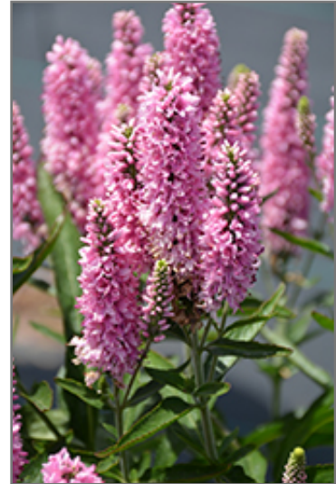
Skyward Pink Long-leaf Speedwell flowers

Skyward Pink Long-leaf Speedwell is a fine choice for the garden, but it is also a good selection for planting in outdoor pots and containers. It is often used as a 'filler' in the 'spiller-thriller-filler' container combination, providing a mass of flowers against which the larger thriller plants stand out. Note that when growing plants in outdoor containers and baskets, they may require more frequent waterings than they would in the yard or garden.