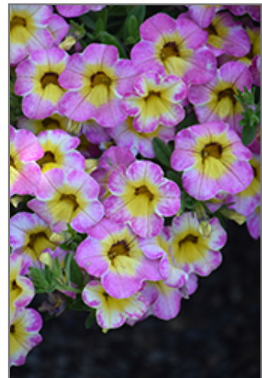
Cha-Cha Diva Hot Pink Calibrachoa flowers