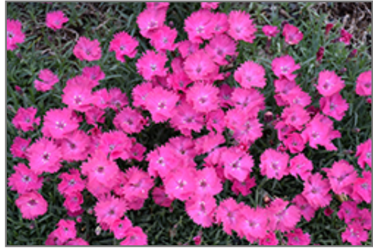
Vivid Bright Light Pinks flowers

Vivid Bright Light Pinks is recommended for the following landscape applications;