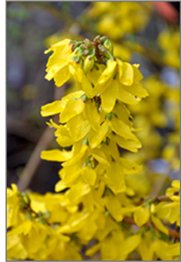
Magical Gold Forsythia flowers

Magical Gold Forsythia makes a fine choice for the outdoor landscape, but it is also well-suited for use in outdoor pots and containers. Because of its height, it is often used as a 'thriller' in the 'spiller-thriller-filler' container combination; plant it near the center of the pot, surrounded by smaller plants and those that spill over the edges. It is even sizeable enough that it can be grown alone in a suitable container. Note that when grown in a container, it may not perform exactly as indicated on the tag - this is to be expected. Also note that when growing plants in outdoor containers and baskets, they may require more frequent waterings than they would in the yard or garden.