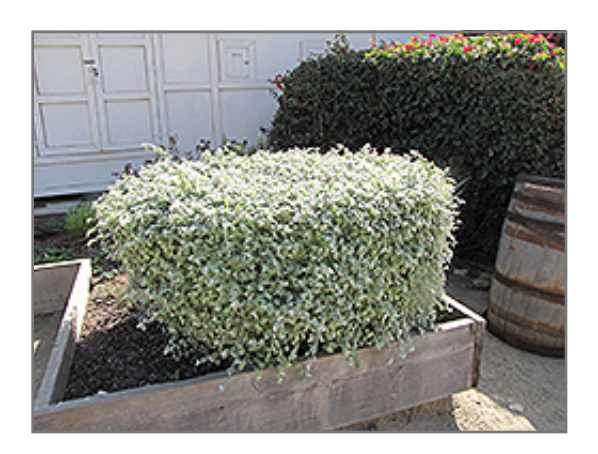
Licorice Plant