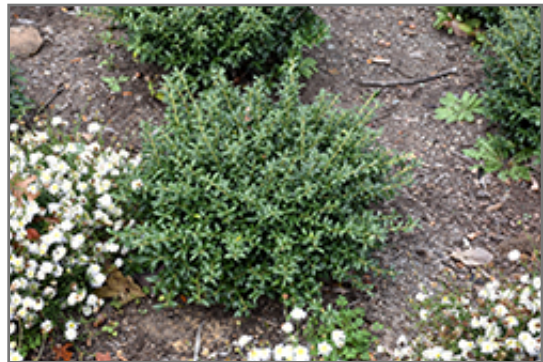
Soft Touch Japanese Holly