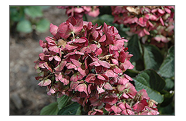
Magical Ruby Red Hydrangea flowers

Magical Ruby Red Hydrangea will grow to be about 4 feet tall at maturity, with a spread of 4 feet. It tends to fill out right to the ground and therefore doesn't necessarily require facer plants in front. It grows at a fast rate, and under ideal conditions can be expected to live for approximately 20 years.