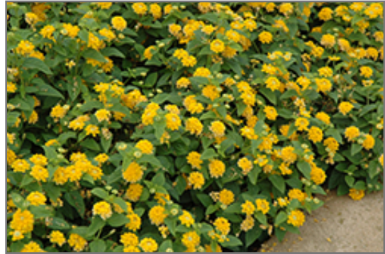
Little Lucky Pot Of Gold Lantana flowers