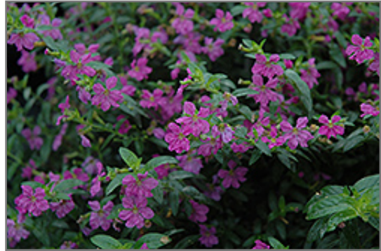
Allyson Mexican Heather flowers