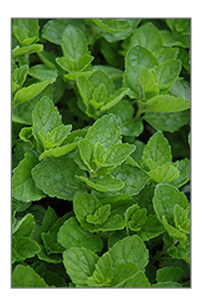
Spearmint foliage