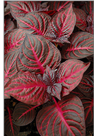
Blazin' Rose Blood Leaf foliage