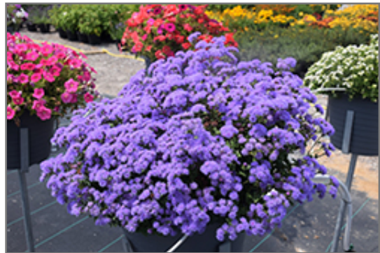
Artist Blue Flossflower in bloom